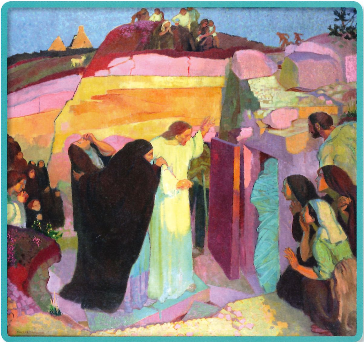
The Raising of Lazarus, Maurice Denis, 1919.