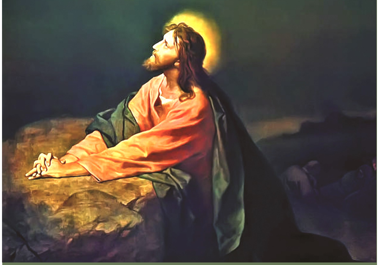
"You shall love the Lord your God, with all your heart, with all your soul, and with all your mind."