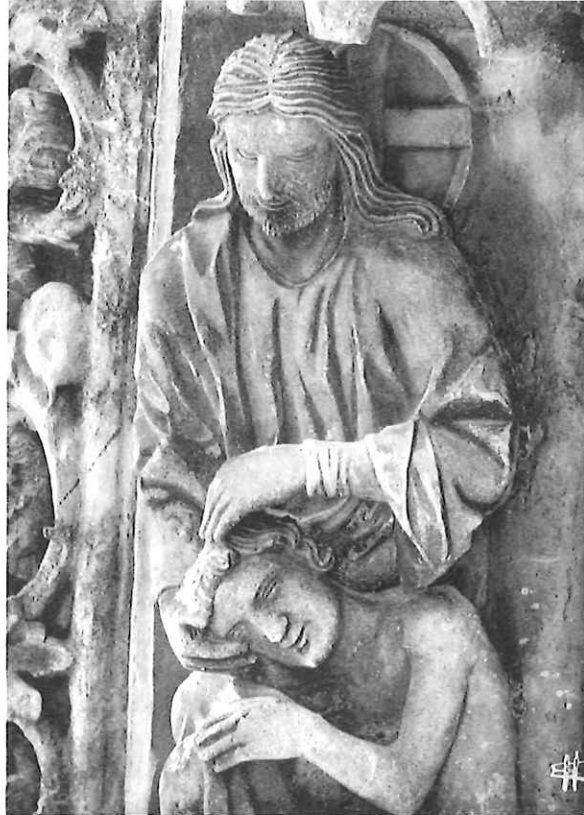
Statue of Christ and St. John on the exterior of the Cathedral of Chartres, France, dating from the 13th century

An interesting special feature of this whole process is the Church's appointment of a competent person called the Promoter of the Faith (in earlier times, this person was called the "Devil's Advocate"), whose only duty is to present obstacles to the cause by questioning aspects of the candidate's life that might disprove his or her practice of saintly virtue, and the orthodoxy of his or her writings and other available pronouncements. The Promoter of