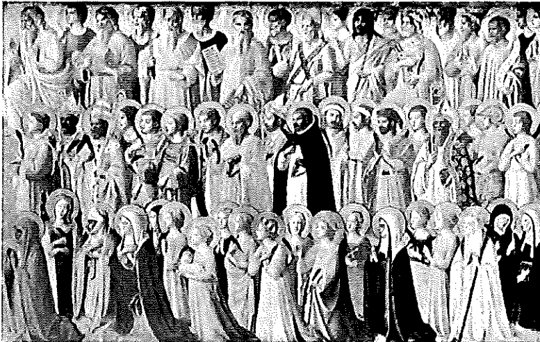
Saints from Predella, detail of the Madonna of San Domenico, by Fra Angelico, 1387-1455

And Mary said, "My soul magnifies the Lord, and my spirit rejoices in God my Savior, for he has regarded the low estate of his handmaiden. For behold, henceforth all generations will call me blessed; for he who is mighty has done great things for me, and holy is his name. And his mercy is on those who fear him from generation to generation. He has shown strength with his arm, he has scattered the proud in the imagination of their hearts, he has put down the mighty from their thrones, and exalted those of low degree; he has filled the hungry with good things, and the rich