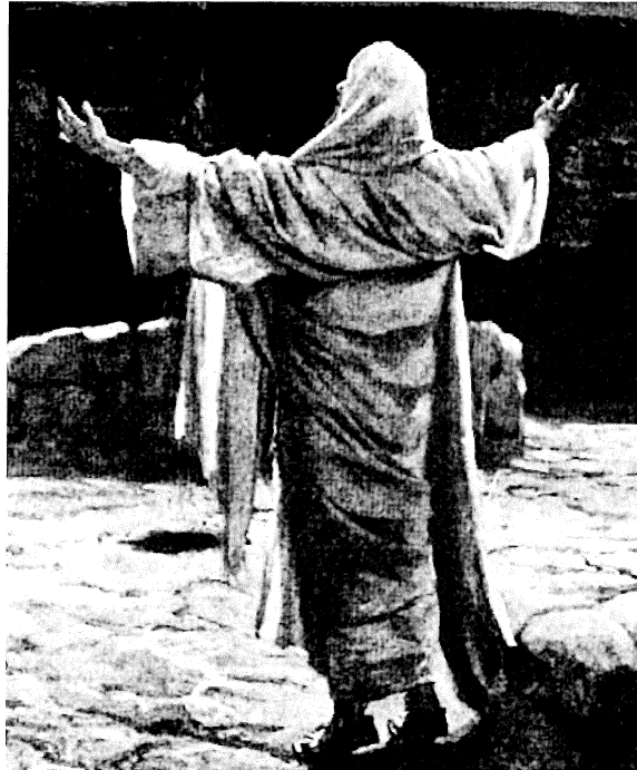
Christ going to the Mount of Olives at night, by James Tissot, 1856-1902

tends to deny that there is such a thing as real right and wrong. It tends to equate whatever one likes with being right and good, and whatever one doesn't like with being wrong and bad. How on earth did we get such an idea of human freedom? To answer this question, we must turn to consider what kind of morality lies behind this understanding of human freedom.