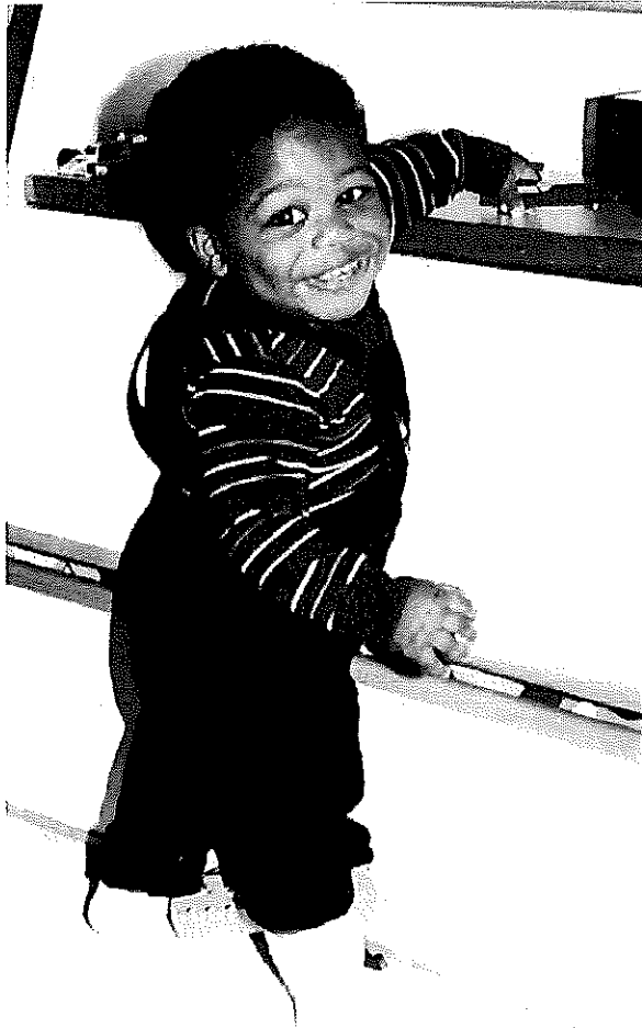
A child is always a blessing

artificial interference with conception is acceptable because, so it is supposed, human beings are mere biological beings. Yet Sacred Scripture teaches us that our bodies, like our souls, are holy to God: “Shun immorality. Every other sin which a man commits is outside the body; but the immoral man sins against his own body. Do you not know that your body is a temple of the Holy Spirit within you, which you have from God? You are not your own; you were bought with a price. So glorify God in your body” (1 Cor 6:18-20).