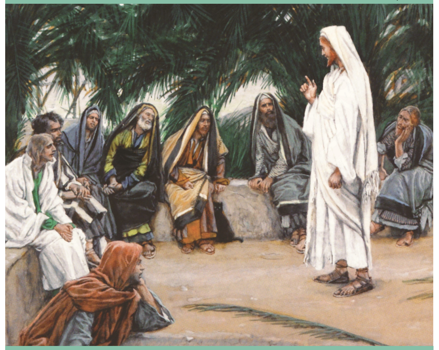
"Blessed are you when people hate you, and when they exclude and insult you, and denounce your name as evil on account of the Son of Man."

970-352-1060 (x1 for sacramental emergencies only)