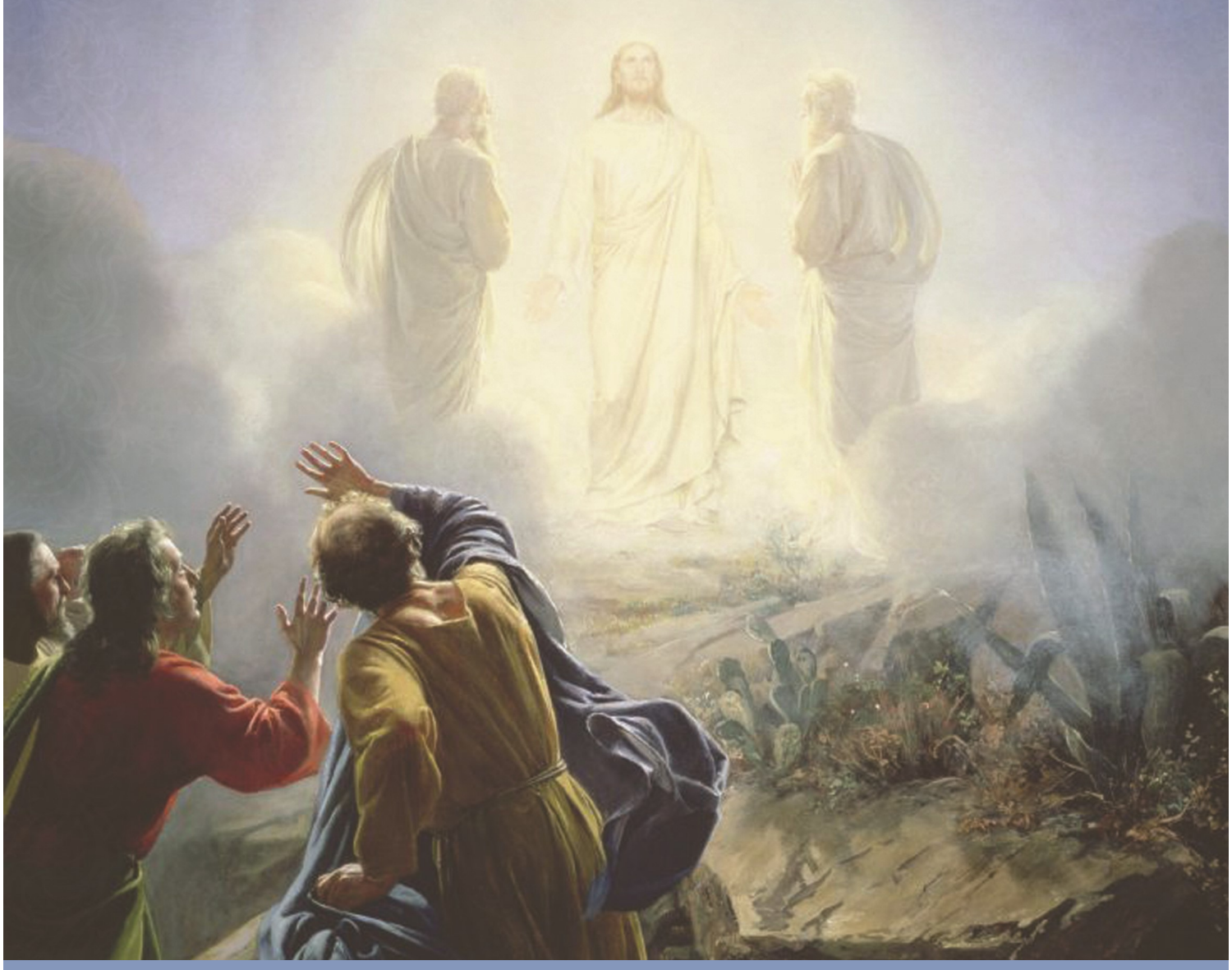
While he was praying his face changed in appearance and his clothing became dazzling white.