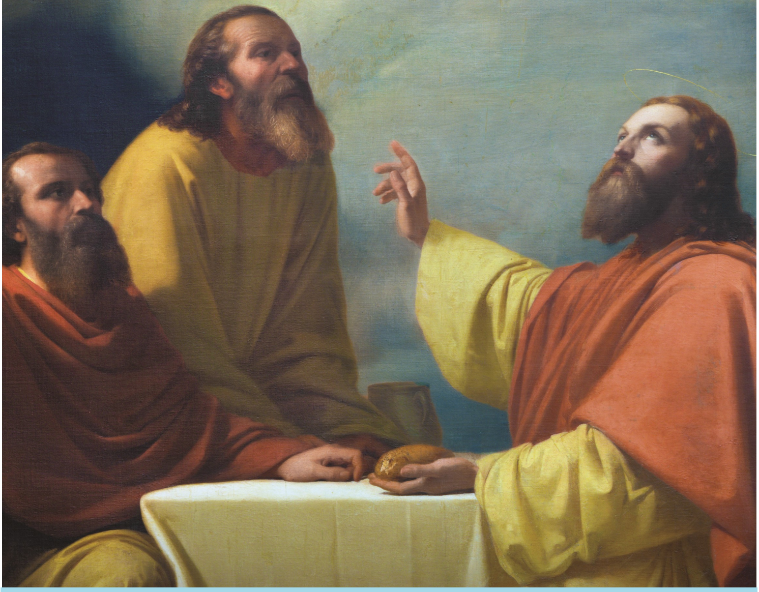
"I will ask the Father, and he will give you another Advocate to be with you always, the Spirit of truth." John 14:16-17a